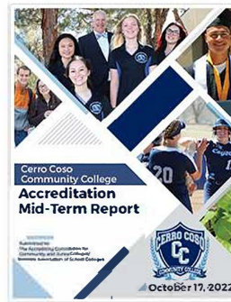
Accreditation 2022 Midterm Report (draft)

Cerro Coso encourages a broad base of participation in the preparation of this Midterm Report. We would like your thoughts and ideas how to improve the current document. This "draft" version represents input already from faculty and management co-writers, committees and work-groups relevant to the various action items and institutional improvements, and the Accreditation Steering Committee. This draft version is available now and open for feedback until Friday, April 29 . At that time, the Accreditation Steering Committee will compile the final document in preparation for KCCD Board approval during the summer. Thank you for your interest in this process and your ideas for improvement!