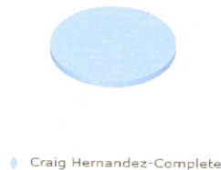
Work Order Counts Cerro Coso Ridgecrest/IWV All

Note: IE users can right-click on the graph to print. Calculations shown on this page represent costs through yesterday.