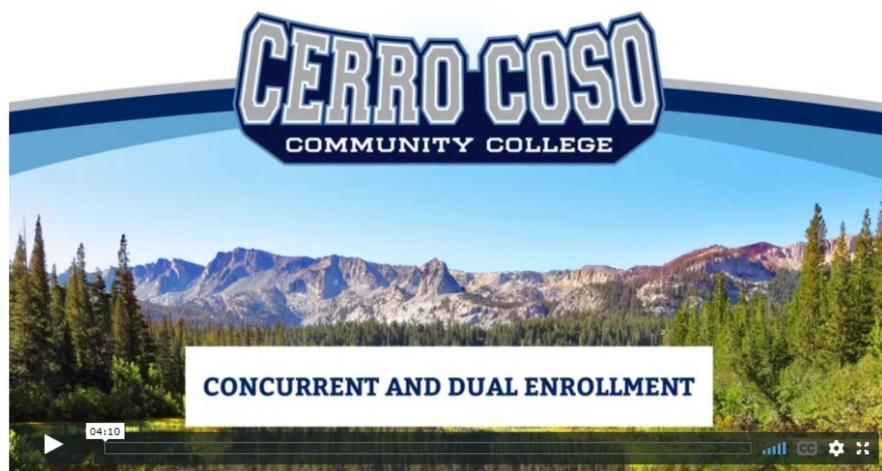
Instructional Video - CONCURRENT AND DUAL ENROLLMENT from Cerro Coso Community College on Vimeo.

In order for students to be placed in course work in a quick and effective manner, it is important that the process for enrollment is followed and that all instructions are read and understood by the parent or guardian, prospective student and school official.