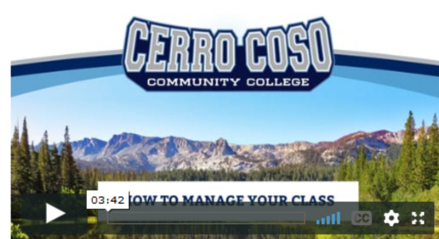
Instructional Video - HOW TO MANAGE YOUR CLASS from Cerro Coso Community College on Vimeo.

Want to know how to add, drop, and withdraw from classes? Watch this instructional video on How to Manage Your Schedule!