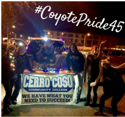
A spirited photo submitted by the staff, faculty, and students at the Tehachapi campus

If there is one type of media that fits into the high-sharing and fast-moving media category in an age of social networks, it is photos. The College's 45th Anniversary Photo Contest aimed to capture the essence of college life at all Cerro Coso campuses. Facebook, Instagram, Twitter... staff and students at all campuses were invited to show their coyote pride during the month of February by uploading photos taken around campus to social media with the hashtag #CoyotePride45.