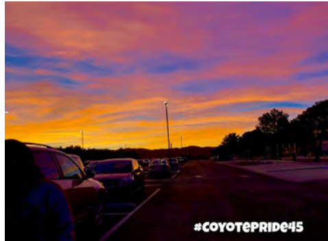
A view of the sunset from the Ridgecrest/IWV campus main parking lot submitted by Madison Bowdridge.